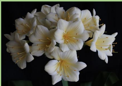
Orient Jealous Love Breeding for outstanding splash type bicolours