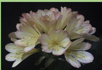
Chinese Blush Breeding for compact Blushes with recurve flowers