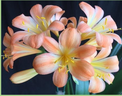
Tiffeny Breeding for green throat Tiffeny