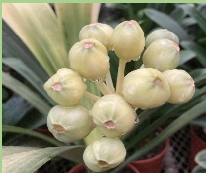
LOB split for Gr2 Breeding for group 2 yellow/green LOB