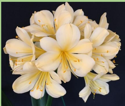
Sky Chase Breeding for quality gr1 yellows