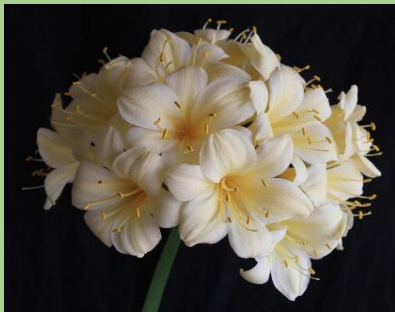
Appoline Reverse cross of CV 22004