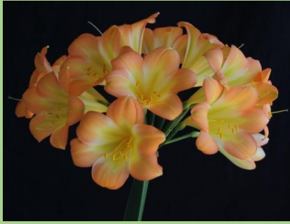
Soft Touch Breeding for recurve bicolour