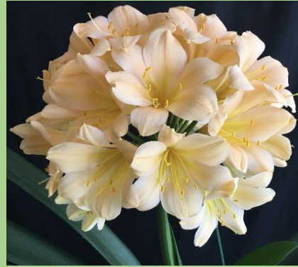
Group 1 Peach GT