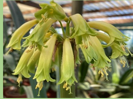
Golden Renaissance Original