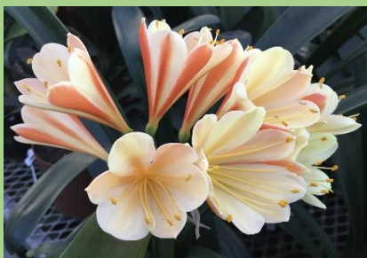
Emmadale F1 Breeding for improved shape versicolours