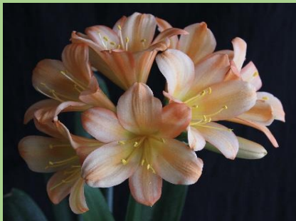
Ghost Combining two outstanding ghosts