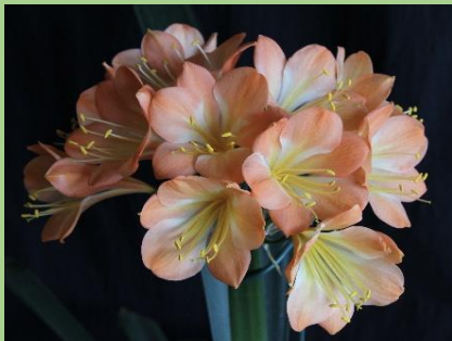
Emmdale F1 Breeding for improved shape versicolours