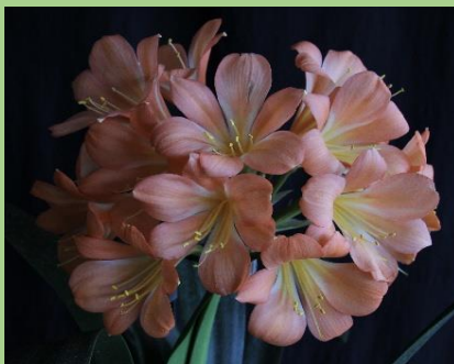
Emmadale F1 Breeding for improved shape versicolours