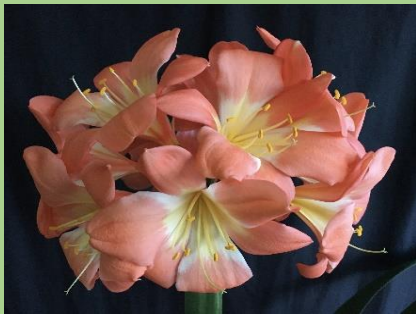
Ghost Nr2 Breeding Podparent has huge flowers. Hope to get percentage large Blush recurve flowers