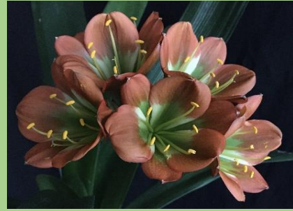
Very Dark Bronze