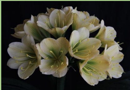
Europen Peach GT Breeding for pink green combination