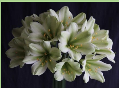
Hirao Breeding for improved greens.