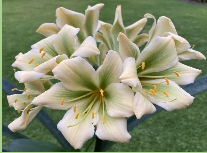
Hirao Breeding for improved greens.