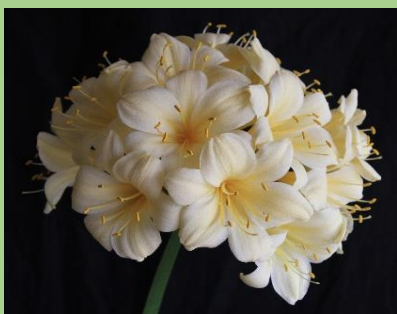
Appoline Crossing two outstanding yellows