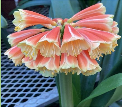
Koi 73 A cross between two icon plants