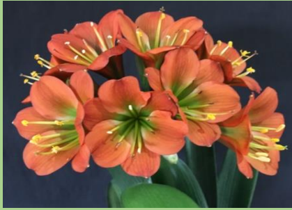
Belgen Bronze Breeding for dark bronzes