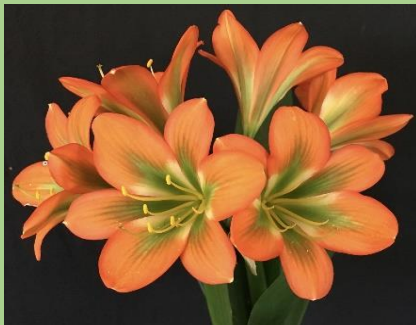
Angelica Breeding Breeding for Angelica type offspring