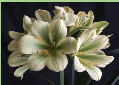
Hirao Breeding for improved greens.