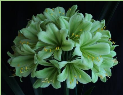
Charl's Green Breeding for size. Not sure if Yster splits for green.