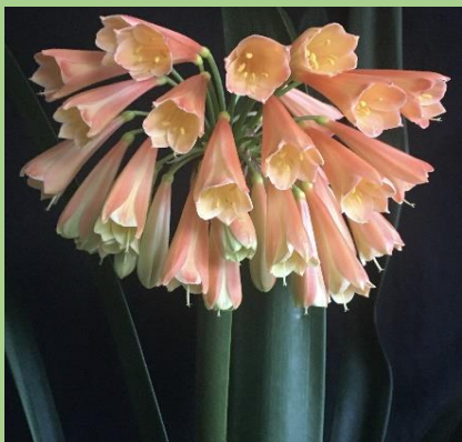
Mirabilis Cross Breeding for yellow Mirabilis type flowers