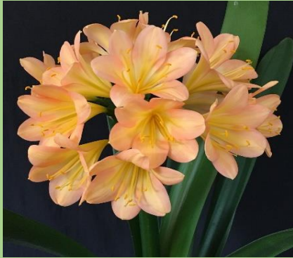
European Peach Breeding for much larger flowers.