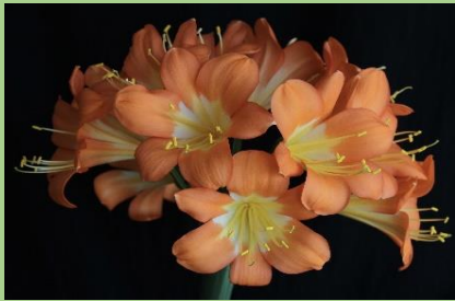
Bella Donna Mia Aim for few top quality greens as BDM splits fot gr2