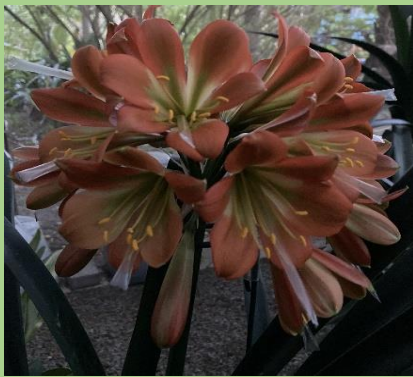
Star Green x Charl's Green Breeding for Versi Colours