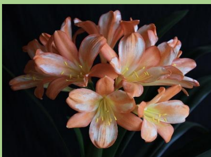
Ghost Breeding for green throat gosts