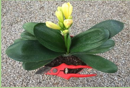
Compact Blush Breeding for compact Blusch plants