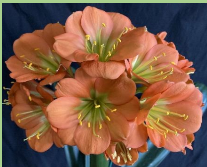
Choc Mint Breeding for many tepal bronzes