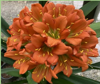
Bronze Interspec Breeding for dark bronze interspecs