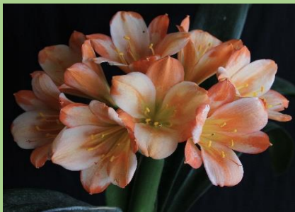
Ghost Breeding for green throat ghosts