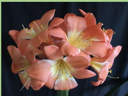
Ghost Nr2 Breeding Combine size, compact, blush and recurve