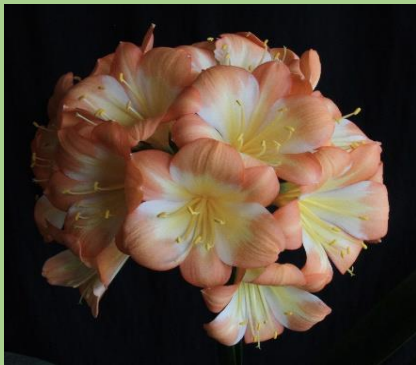
Split Hirao Breeding for greens with improved form