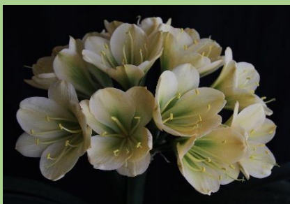
Europen Peach GT Breeding for much larger flowers.