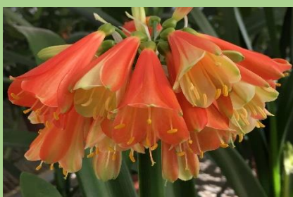
Nobilis Cross Breed for versi type interspecs