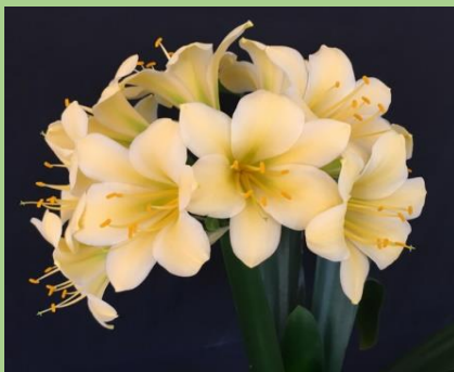
Karkloof GT Aiming for a percentage Blushes and hopefully the odd green throat amongst them