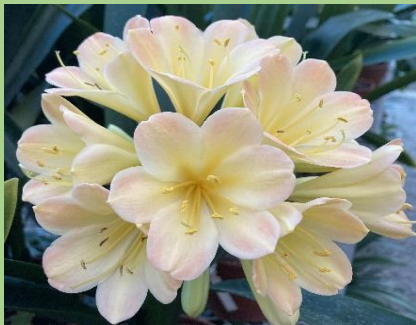
Gloria Breeding for high count blushes with larger flowers