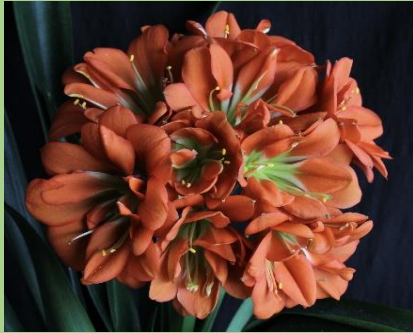
CV 22038 R 120