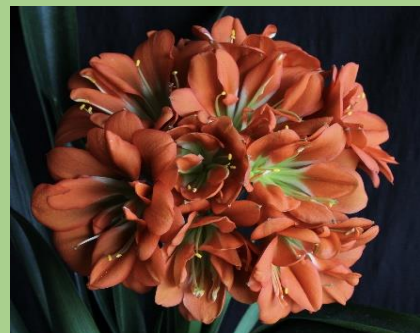
7 x 7