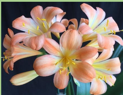
Tiffeny Breeding for green throat Tiffeny