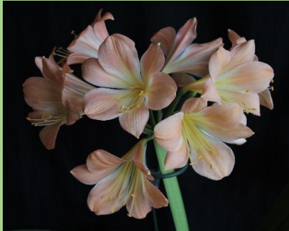
Emmdale F1 Breeding for improved shape versicolours