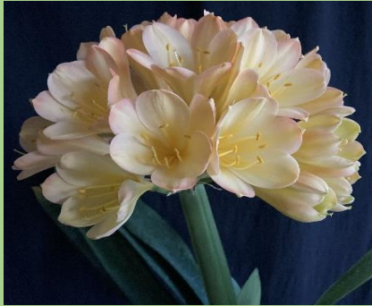
Chinese Blush Cross made to get a percentage recurve blushes